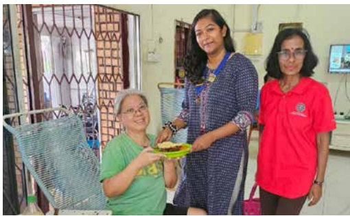
22/11/24 Diwali CSR to 20 inmates Vijay Folks Home in Taman Tunas