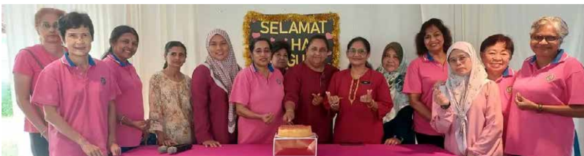
Celebrating Tireless Teachers of Sekolah Semangat Maju- 19.5.25