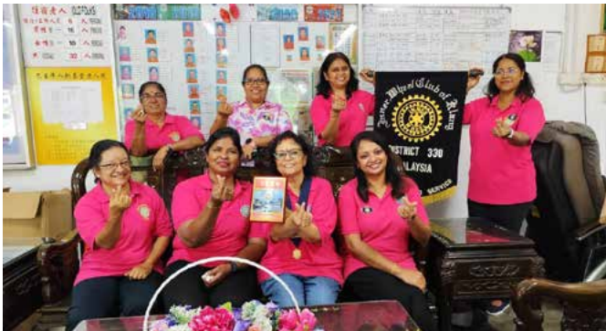
22/9/2024 – Visit Kelab Chik Thong Old Folks Home