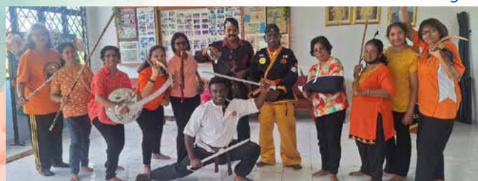
Self-defence for women. "Hands that can slice vegetables can also dice enemies."