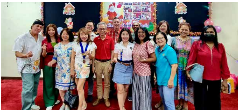
Dec'24-You Are Not Alone: Restoring Hopes and Increasing Optimism of Underprivileged Single Mothers with Children and Christmas fellowship