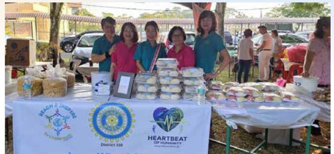
Aug'24-Fiesta Fun Fair – Fund raising for care ,organized by Penang Hospice and Nov'24 - Bazaar Food Fair - Fund raising for Children Rumah Charis