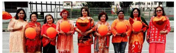
Orange The World – an awareness activity