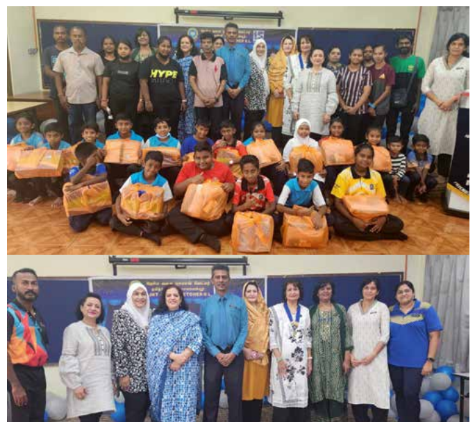
Back to School Project on January 10, 2025