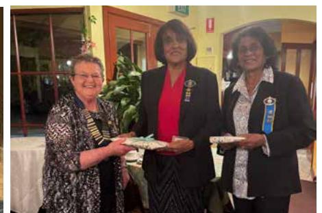
Fellowship with IWC of Wandin, Australia – 15/10/2024