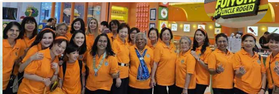
Inner Wheel Club of Kuala Lumpur engaging awareness of Orange The World with Diamond Youtuber Uncle Roger