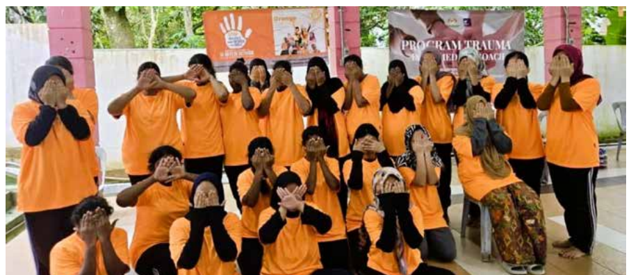
Collaboration with Soroptimist – Orange the World