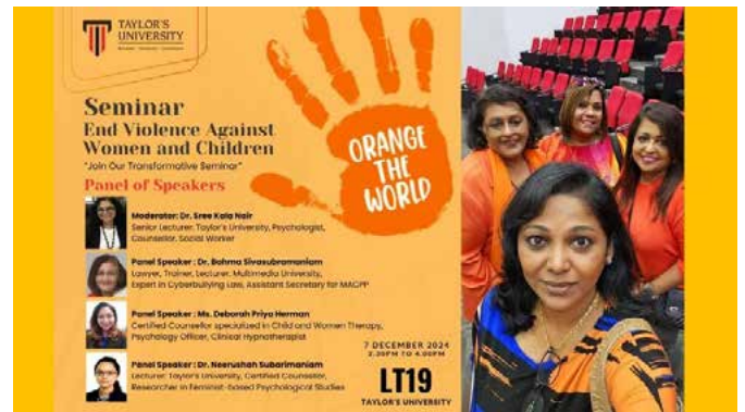
Dec 2024 – Orange the World Seminar Collaboration with IWC Klang