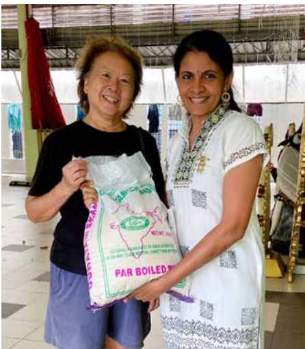
Collaboration with IWC West Singapore – Donation of rice