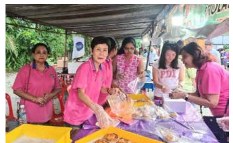
Brisk Sales at Sekolah Semangat Maju Charity Food Fair - 20.4.25