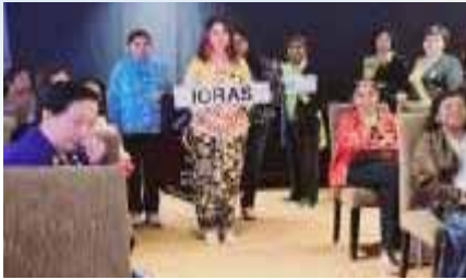
At the District AGM, Sep 2024