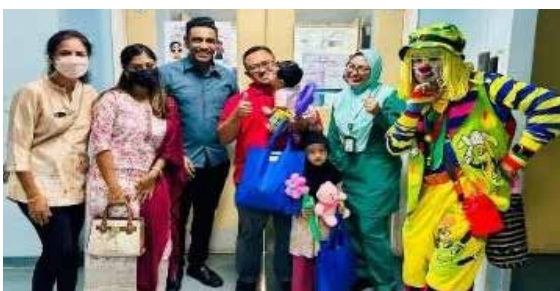
Bringing Sunshine to the Paediatric Ward at UMMC