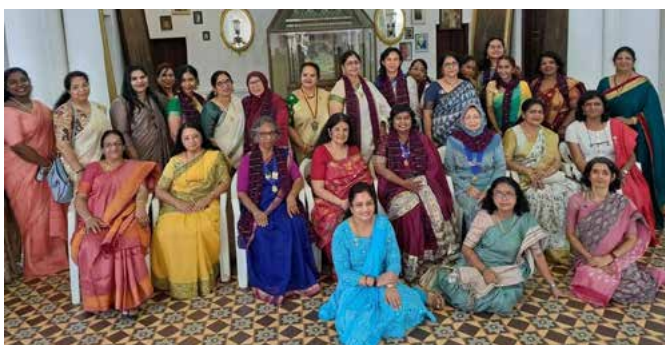
Fellowship Across International Borders