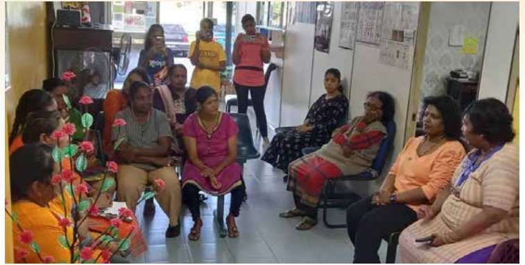
Dialogue Session in Conjunction with Orange The World Campaign