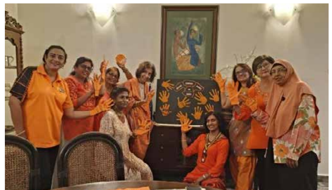
Orange The World – awareness campaign, 3.12.2024