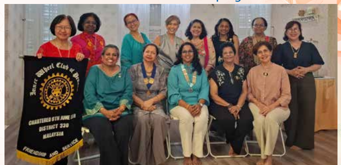
11 Jan 2025. IWC Penang