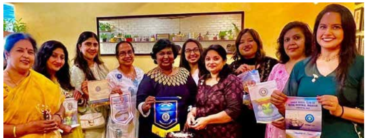
World Inner Wheel Day Celebration