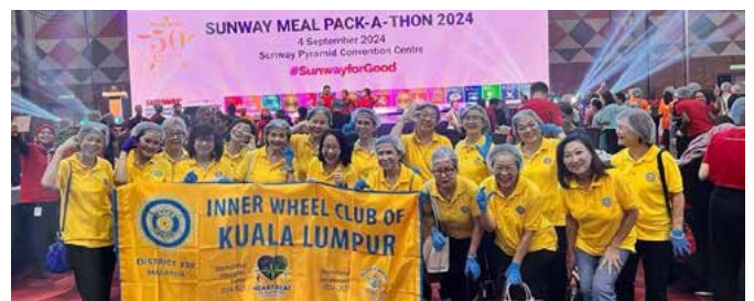
Rise to Hunger Pack-a-Thon