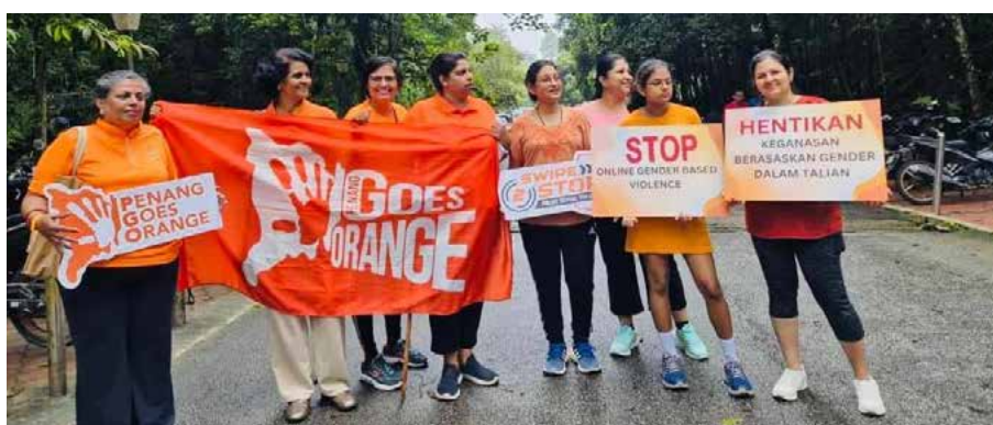
Raising awareness about Violence Against Women – 1 Dec 2024