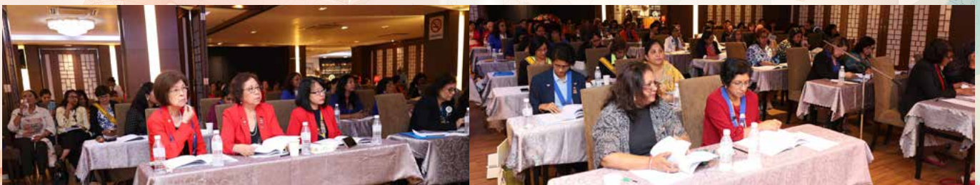
Delegates at the meeting