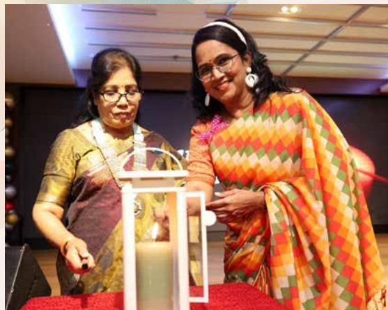
Lighting the Candle of Friendship