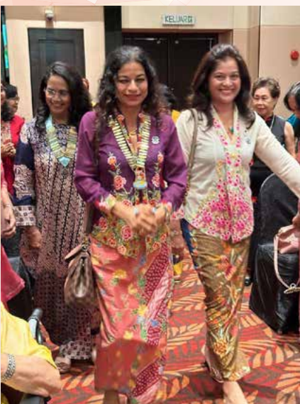
International President looking elegant in traditional nyonya kebaya as she makes her entrance at the Gala Night