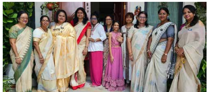
18/8/2024 –Annual General Meeting and Onam Celebrations