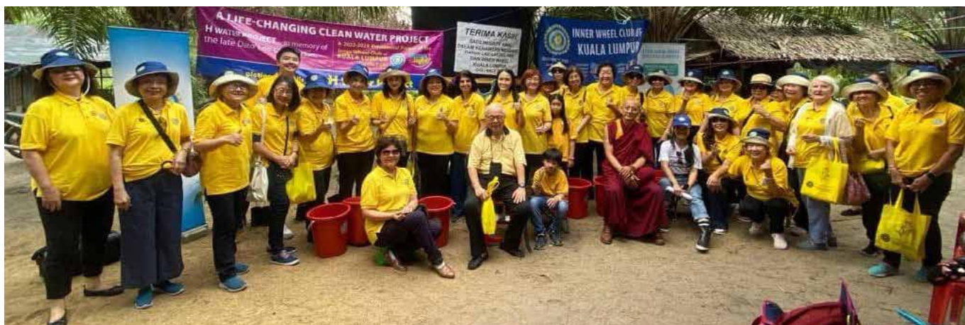
H Water Project in Pekan