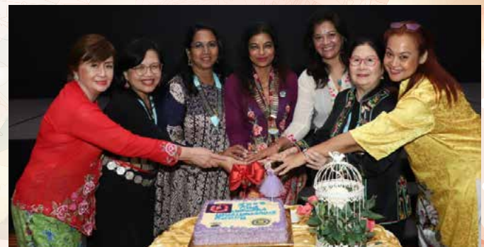
Cake-cutting in celebration of International President Mamta's visit