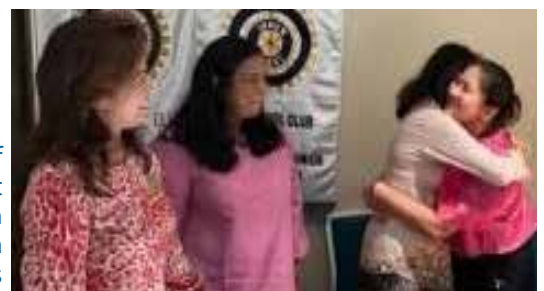
Renewal of sisterhood ontract with IWC San Fernando, La Union, Philippines