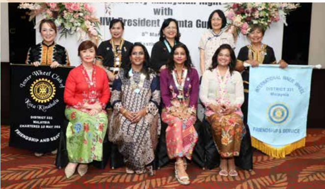
Special guests from District 331 (Malaysian Borneo)