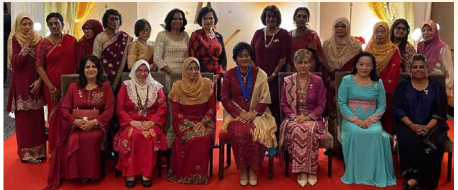
MGA Award for HH Tunku Intan Safinaz – 27/7/2024