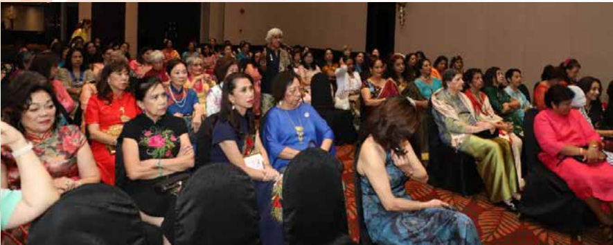
Question & Answer session