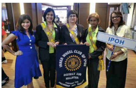
DAGM at Weil Hotel -28.9.2024