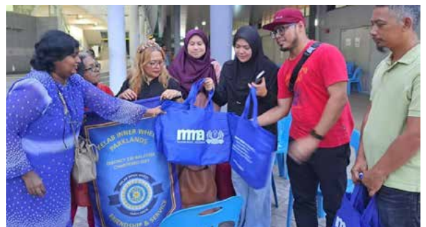
Donated School Stationary Items to Putra Heights Explosion Victim