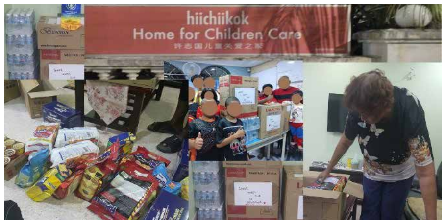
April 2025 – Community Out Reach Urgent Need for Provisions at a Children's Home