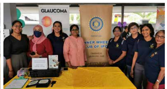
Ayer Tawar Health booth in collaboration with KKM – 3.8.2024