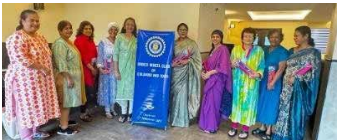
International outreach programme at Hanvella Hospice, Colombo, Sri Lanka