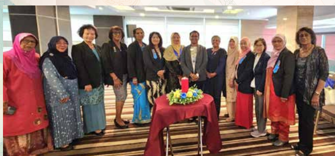
29 Aug 2024. IWC Alor Setar