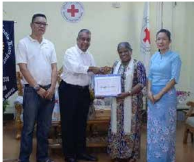
300425 - A Helping Hand for Myanmar Earthquake Victims