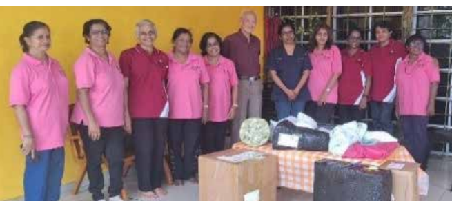
10.8.2024 and 6.3.2025 – Contribution to an autistic centre