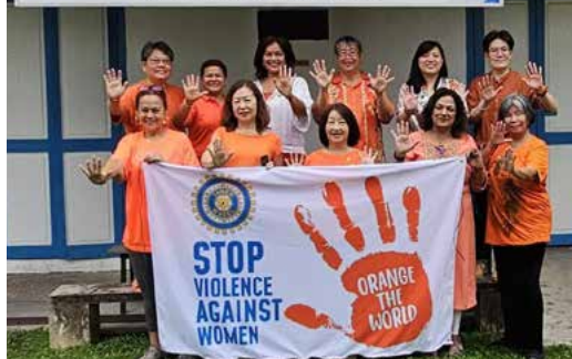
Nov'24-Sharing of Orange the World (OTW) campaign , serving tea, oranges, cupcakes, and dinner to the Lighthouse 'A Place of Hope', a feeding center opened to all regardless of race, religion, or beliefs