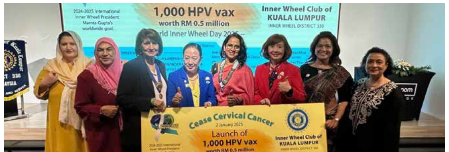
Members attending Cease Cervical Cancer event on 2nd Jan 2025