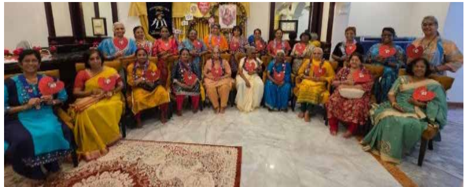
17.5.2025 – A tribute to mothers (Mother's Day celebration)