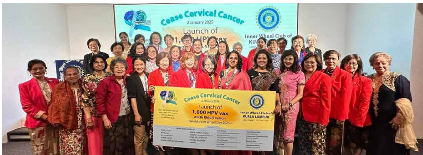
HPV CCC Project