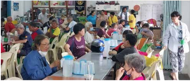
29th Oct 2024 : Lighthouse community service. RM1060 was donated for a meal