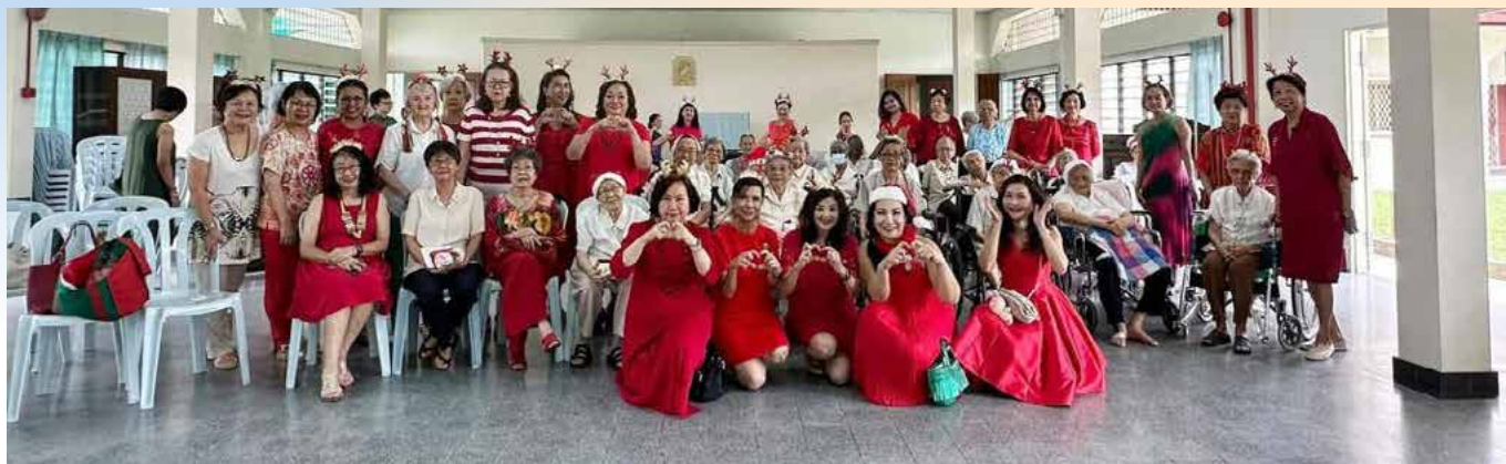
Christmas Fellowship & fund raising