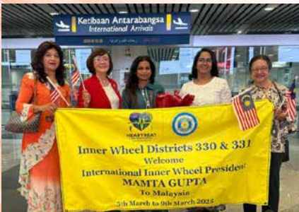
Arrival on 5 March 2025 for a visit till 8 March