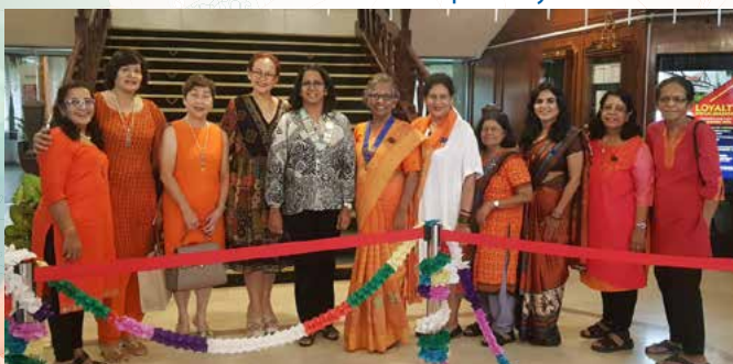
16 Nov 2024. IWC Kuala Lumpur North