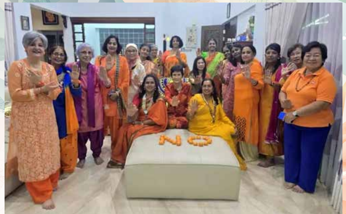
21 Nov 2024. IWC Taiping