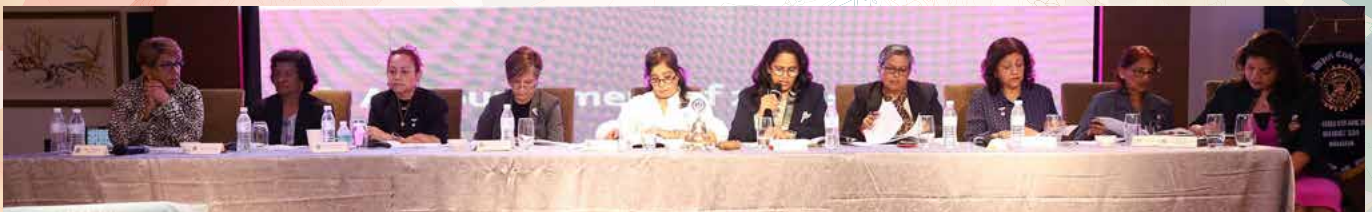
Executive Committee seated at the Annual General Meeting