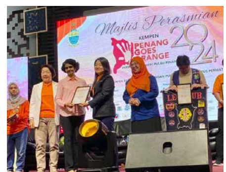
Press conference and launch of the 'Penang Goes Orange' campaign, 7 Dec