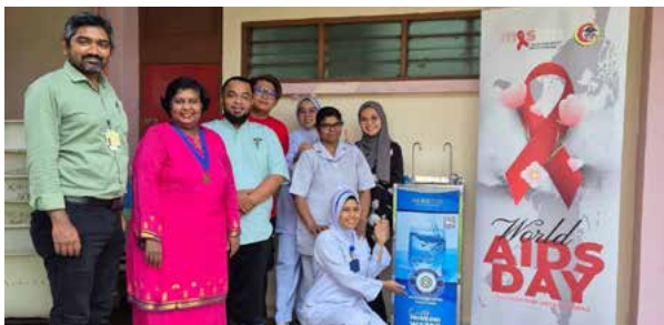
Donated Water Dispenser to Infectious Disease Clinic, Hospital Tengku Ampuan Rahimah