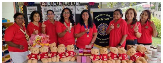
Visit Pemulihan Dalam Komuniti Gugusan Majoi – a centre for special needs children