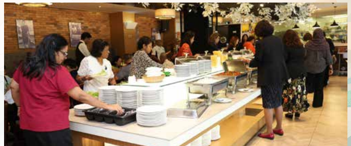
Dinner is served