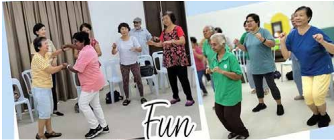
Visit Palliative Care Society