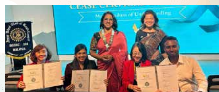
MOU between the Inner Wheel Club of Kuala Lumpur and the National Cancer Society of Malaysia