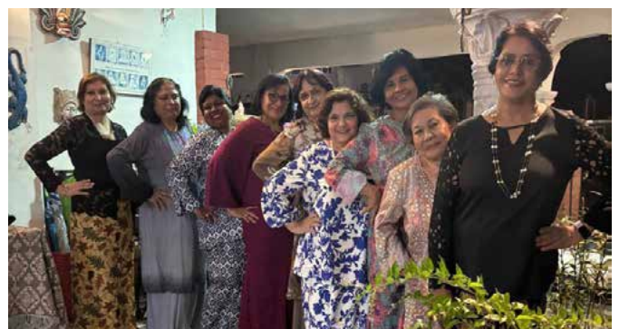
Hari Raya fellowship