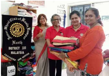
030824 - Saree Distribution to Hindu Sevai Sangam