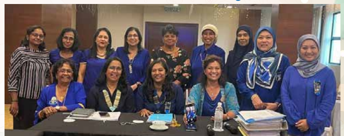
9 Nov 2024. IWC Kuantan/Indera Mahkota