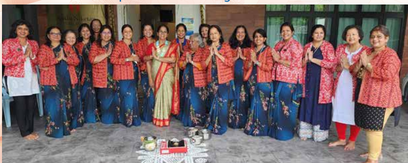
18 Jan 2025. IWC Subang Selangor