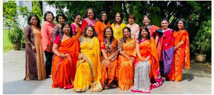
10/11/2024 –Deepavali fellowship & potluck