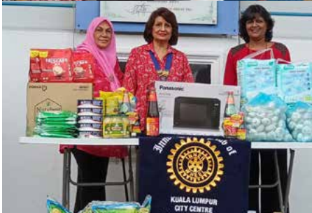
Hari Raya and CNY charity projects in Jan 2025