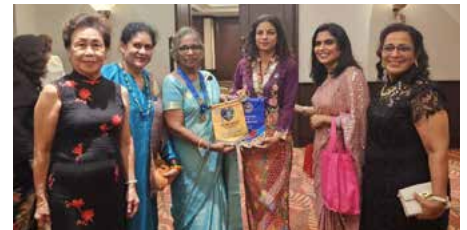
080325 - Celebrating Women, Culture, and Leadership