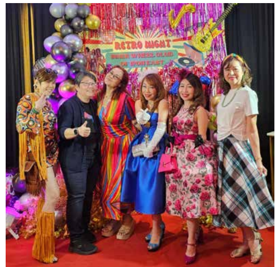
Sept'24 - Inner Wheel District 330 District Chairman Installation, and Members Fellowship