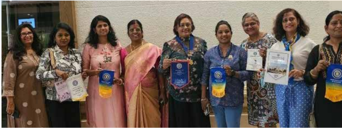
Aug 2024 – Fostering Inner Wheel Friendship Connecting with District 323 - Inner Wheel Clubs of Chennai