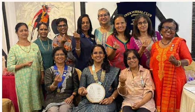
23 Feb 2025. IWC Apsaras