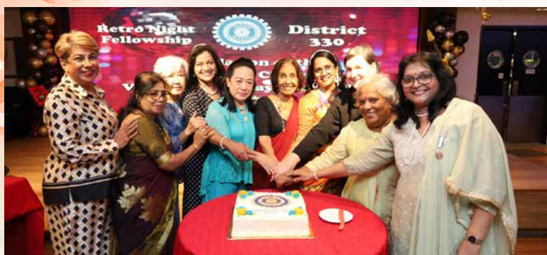
Cake-cutting by Past District Chairmen