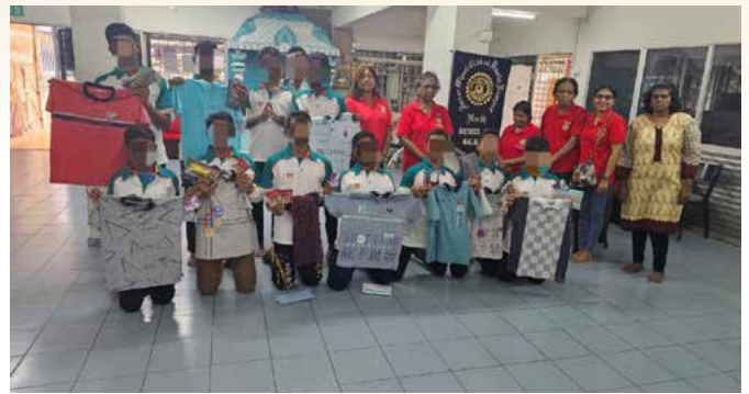
281024 - Deepavali Cheer with Anbu Illam Boys' Home