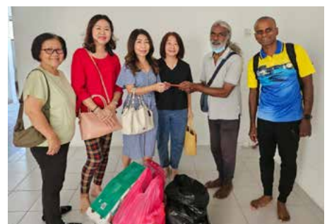
Hong Seng Estate Fire Burn Down Donation