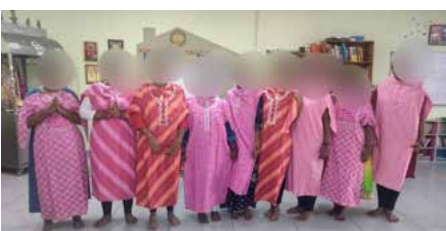
Shine a Light at Anbu Home