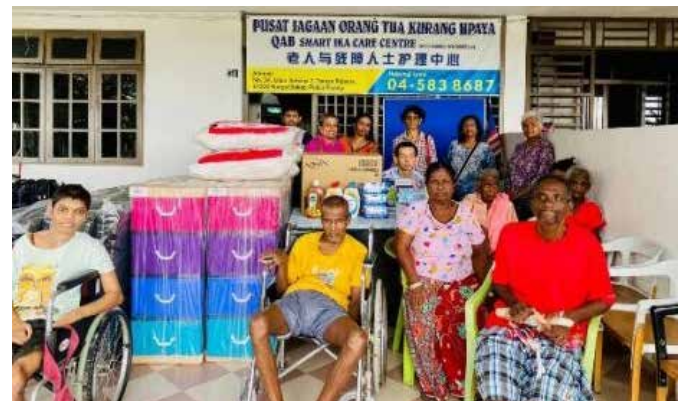
6/10/2024 handed over necessities requested by a home