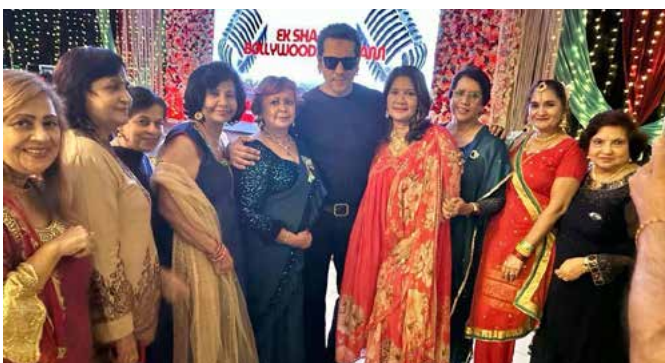
Bollywood night with Salman Khan – a fundraising