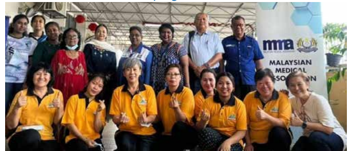
Medical Screening, Donation of Grocery & Medical Kit and Hygiene Kit at Grace Home