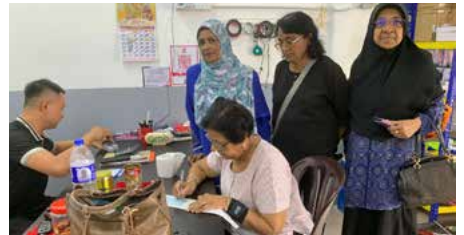
24th March 2025: Grandmother in need. RM1350 was collected and paid towards repairing a much needed car for a grandmother who was the breadwinner in the family.