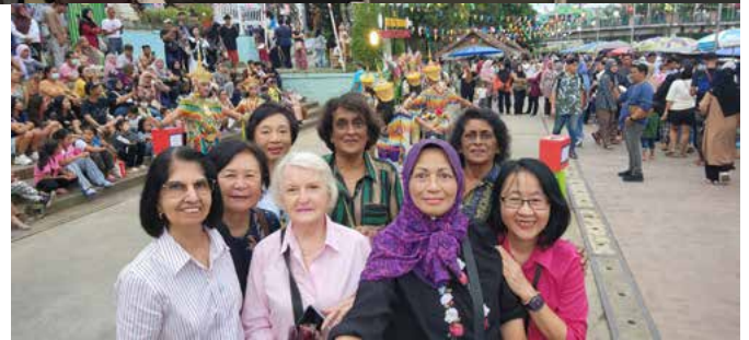
With IWC of KL: Rooftop Dinner and Bowling Tournament – 22/2/2025, and Tour of Hatyai – 23-25/2/2025