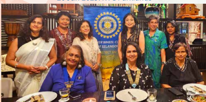
19 Apr 2025. IWC Selangor