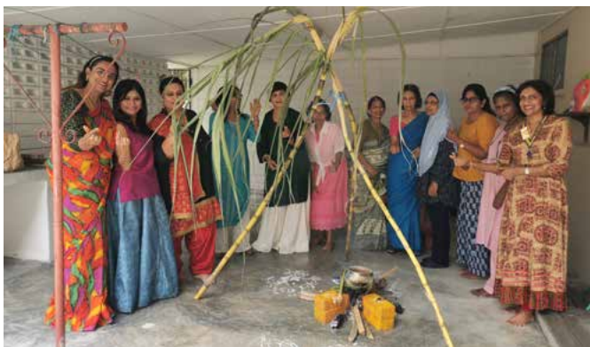
Pongal Celebration – 25.1.2025