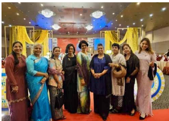
At the Inner Wheel Club of Alor Star on 27 Jul 2024, bestowal of the Margarett Golding Award