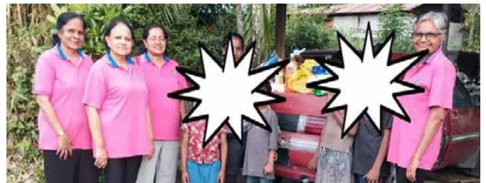
Random Acts of Kindness - 17.10.24