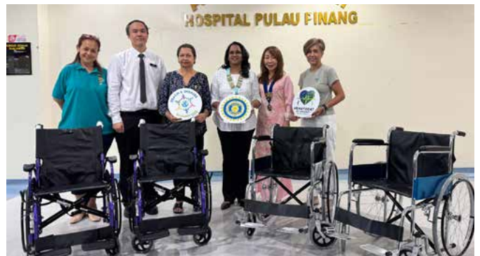
10th Jan 2025: Wheelchair donation to GH Penang. Project spearheaded by IWC POTO. IWC Penang donated a sum of RM1000 for 5 wheelchairs