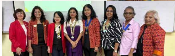
IIW President visiting National Cancer Society of Malaysia (NCSM) with participating clubs Presidents