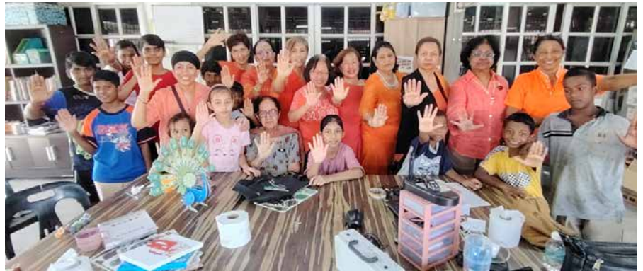
7th December 2024 : RM1700 worth of groceries was bought and donated to Pusat Jagaan Sinar Ceria in Bukit Mertajam.