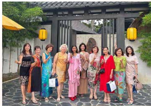
A Song Dynasty Experience with an omakase lunch treat