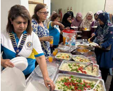
Buka Puasa for Lembah Subang PPR flats