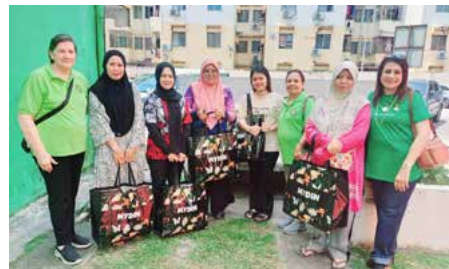
Hari Raya cheers grocery distribution by club members to needy families