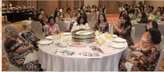
Members seated in the hall