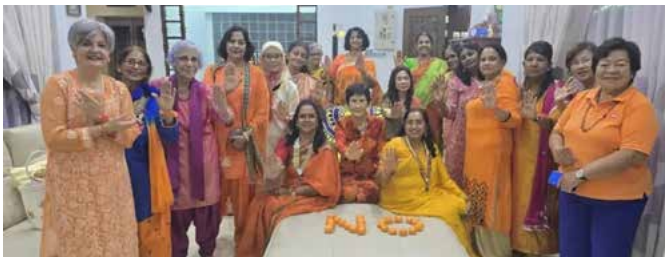
DC' s Visit cum Deepavali Duo-21.11.24