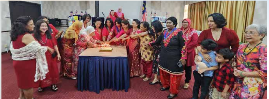
Installation Lunch on 8th September, 2024