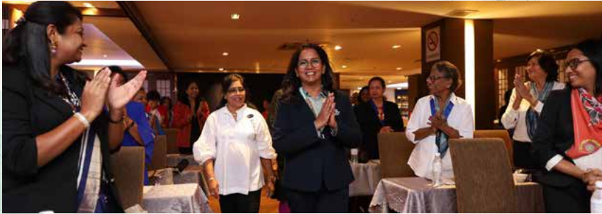
District Chairman walks in for the Meeting