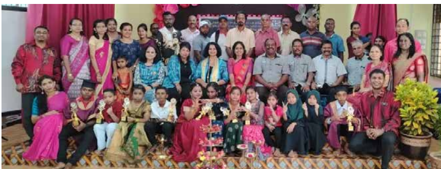
RM1K Donation to SJK( T) Ladang Matang- 9.1.25