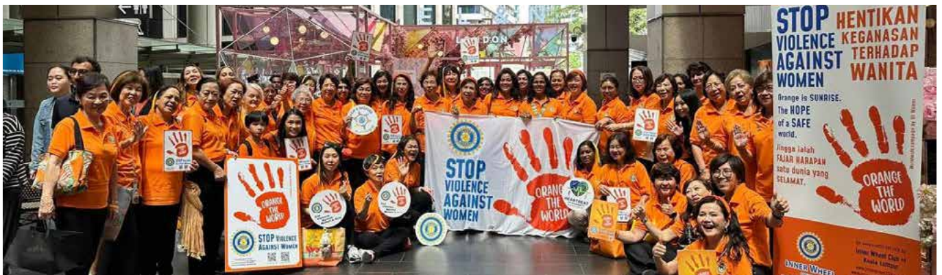
OTW with Uncle Roger