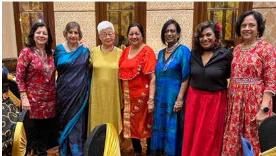
Happy Club members during Installation time