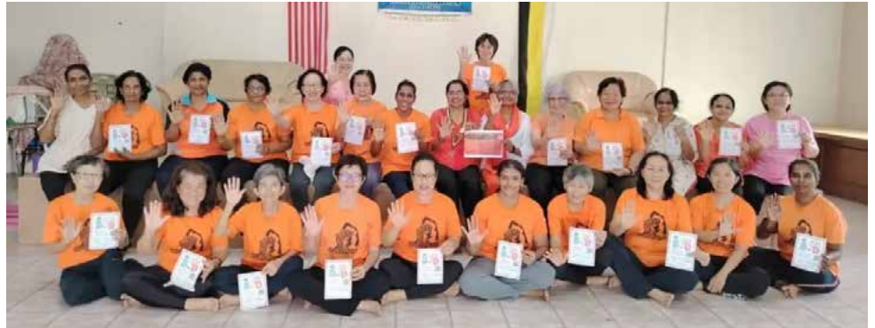
Creating Awareness on OtW campaign- 30.11.24