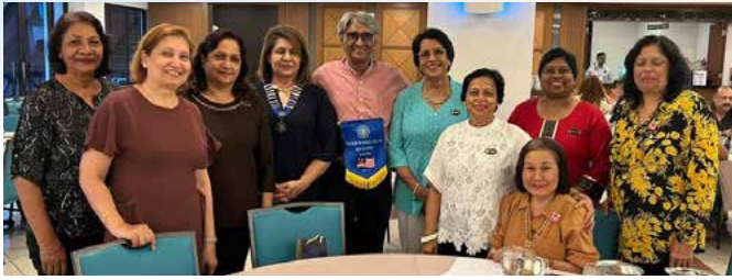
Talk on mental health