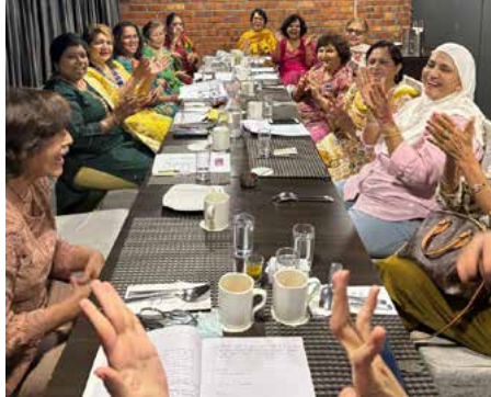
Laughter yoga on official visit of DC