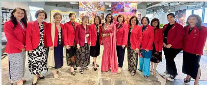
2 Jan 2025. IWC Kuala Lumpur