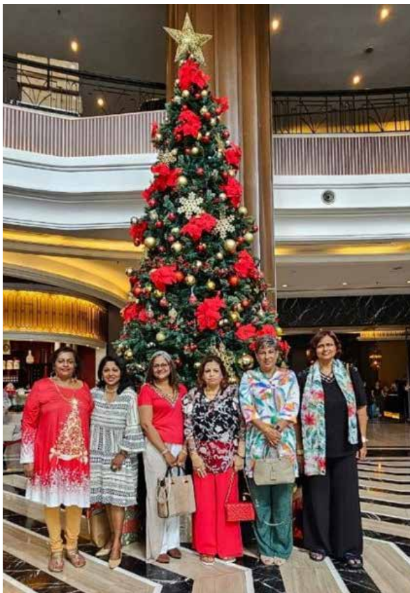
Dec 2024 – Celebrating Festivities Club Christmas Gathering & Fellowship