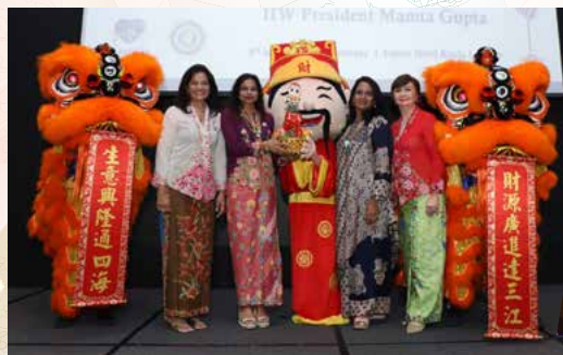
A thunderous welcome of Chinese drums by a prancing pair of traditional Chinese lions, topped with a gift from the deity of prosperity