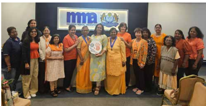
071224 - Seminar on Health for Elderly