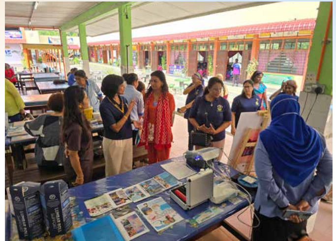
Health Talk on Hygiene and Cervical Cancer at SMK Seri Puteri Buntong – 7.3.2025