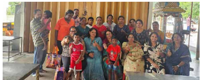
20/10/2024 -Deepavali goodies distributions