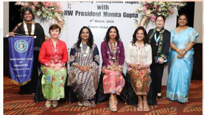
Special guests from District 332 (Inner Wheel Singapore)