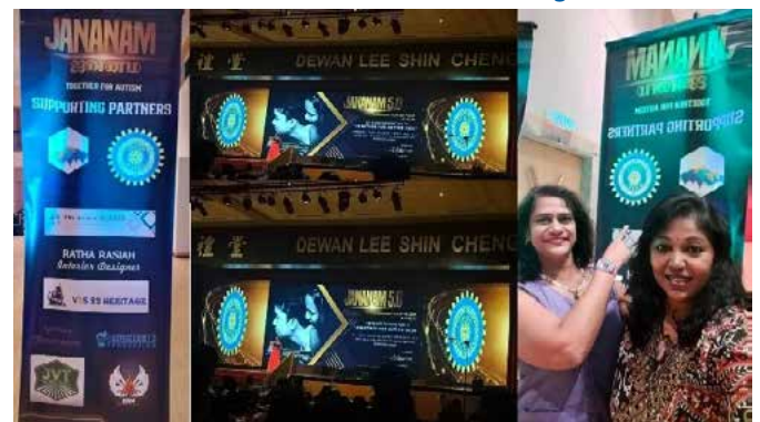
May 2025 – Community Out Reach Supporting Sponsor for Jananam 5.0 – Together for Autism