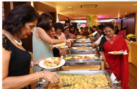
Dinner is served