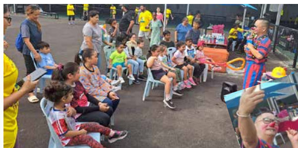
Children having fun with the clown