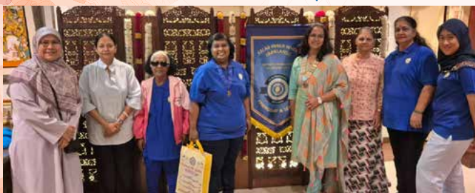
20 Jun 2025. IWC Parklands