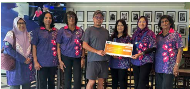
Donation to Children's Home of Hope – 18/9/2024