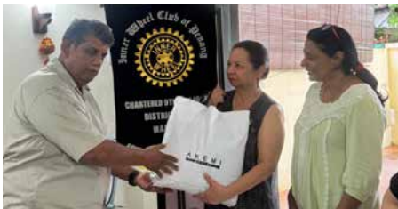
9th April 2025 : Donated pre-loved clothes and household items through Penang Hindu Association Board to B40 families