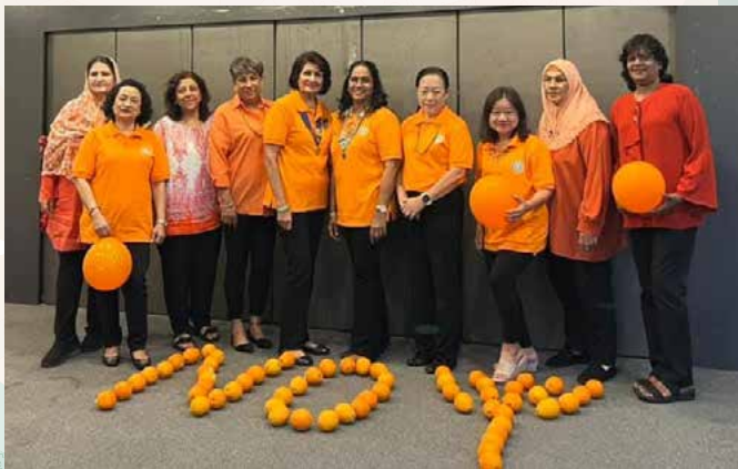
11 Dec 2024. IWC Kuala Lumpur City Centre