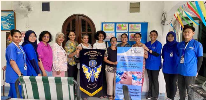
Daffodils Care Home – Free dental check-up, 22 Mac 2025