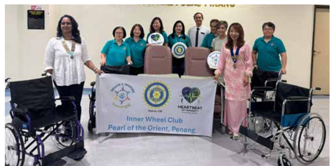
Donated wheelchairs to Hospital Pulau Pinang. Jan'25