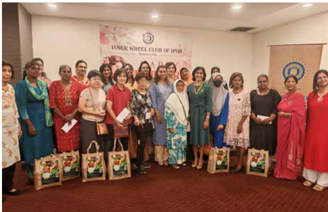
Mother's Day Celebration – 17.5.2025