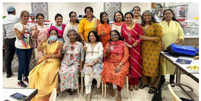
260824 - Flag Exchange in Chennai