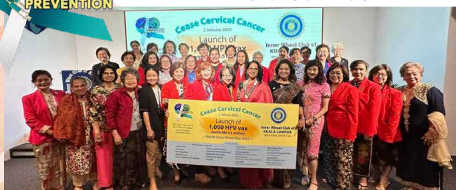
Successful organising by the Inner Wheel Club of Kuala Lumpur. Contributions from Inner Wheel Clubs, individual members and friends to provide 1,000 doses of the human papillomavirus (HPV) vaccine to the needy.