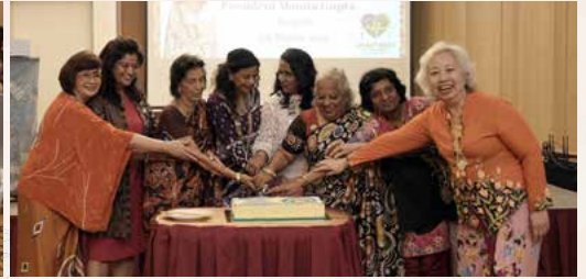
Cake cutting to celebrate Hi Tea with the IIW President