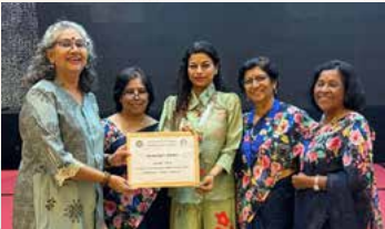
IIW President with IWC Apsaras