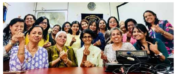
5th Club Annual General Meeting, 20 Jul 2024 at Sentosa Clinic