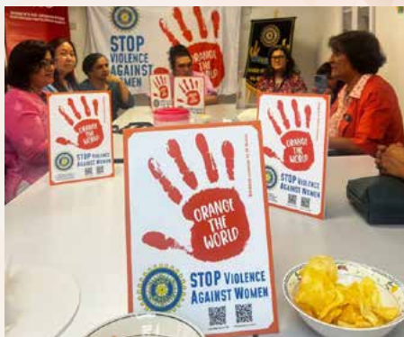
Inner Wheel Club of Alor Setar

25 NOV TO 10 DEC. United Nations' call to UNiTE.