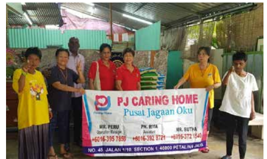
090924 - Project at PJ Caring Home