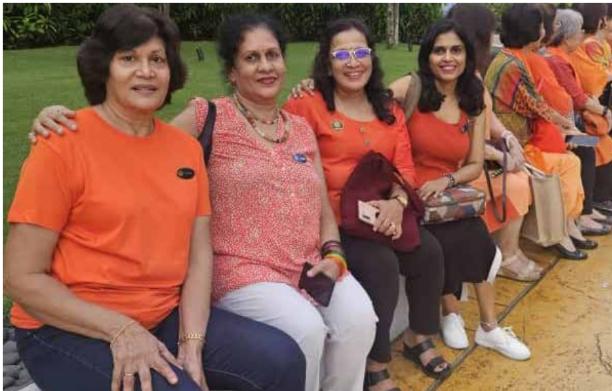
251124 - Orange the World