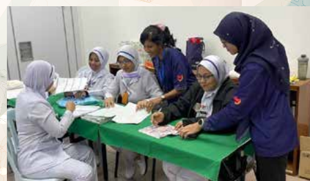
Health screening programme at the Tengku Ampuan Rahimah Hospital.