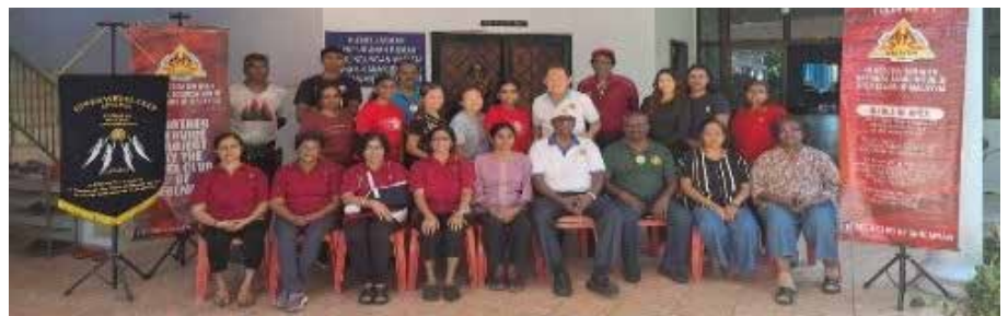
28.12.2024 – Gotong-royong at a shelter home.