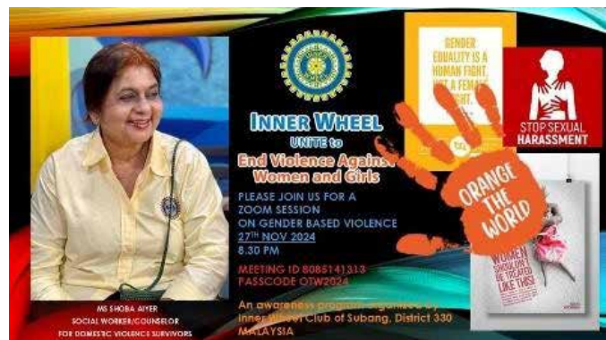
In conjunction with Orange the World 2024