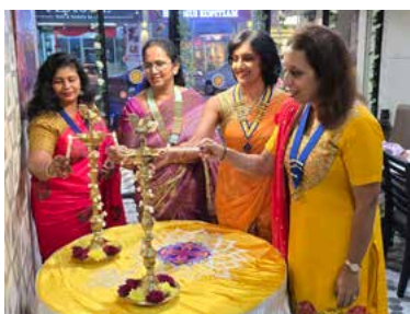
Diwali Night – 10.11.2024