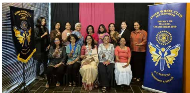
District Chairman's visit on 12 Jan 2025