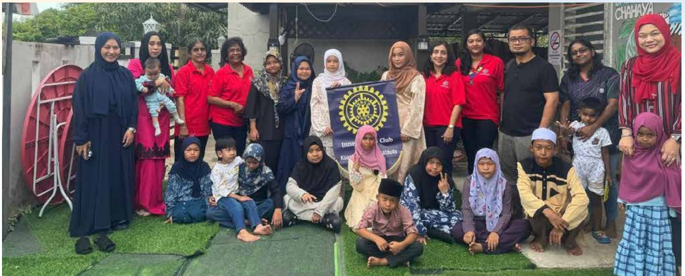
13/3/25 Contribution Juadah Berbuka Puasa to Pusat Jagaan Chahaya