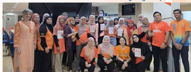
Inner Wheel Club of Taiping's awareness programme with staff of KPJ Medical Centre