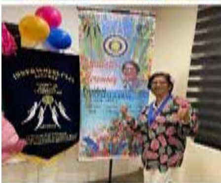
7.9.2024 – Installation ceremony of President Premala S