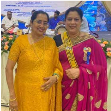
Guests at Goonj South Zone Meet- 20.9.24