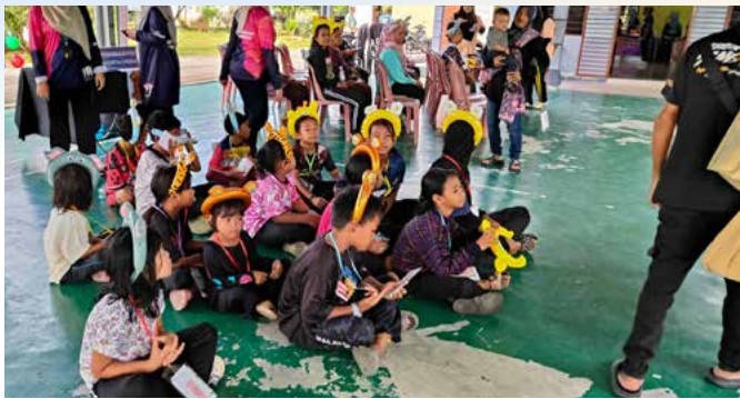
261024 - Orang asli project at Sg Melut