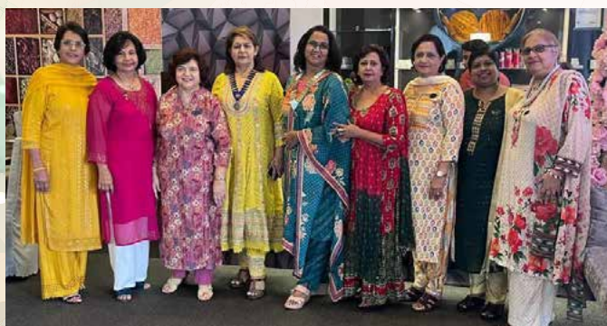
20 Apr 2025. IWC Bangsar