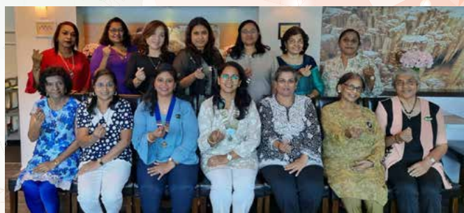
18 Aug 2024. IWC Ipoh East