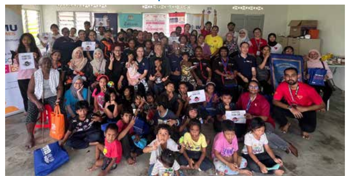
Public CPR, HPV and Breast Cancer Screening