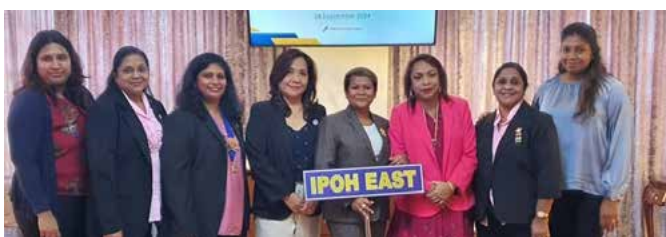
44th District Annual General Meeting