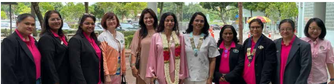
9/3/2025 -IIW President's visit & health screening (cease cervical cancer)