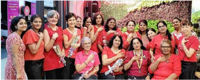
Handover - 21.6.24