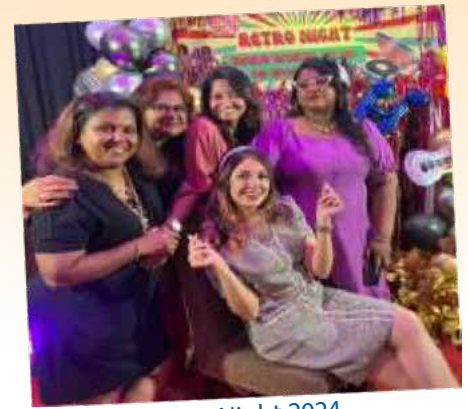
Retro Night 2024