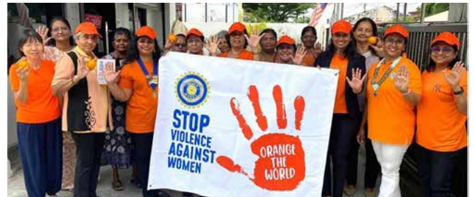
Orange the world campaign