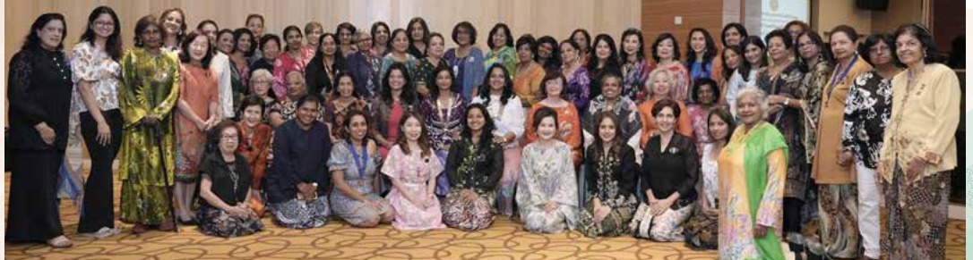
Northern states Inner Wheel members attending Hi Tea with IIW President in Ipoh