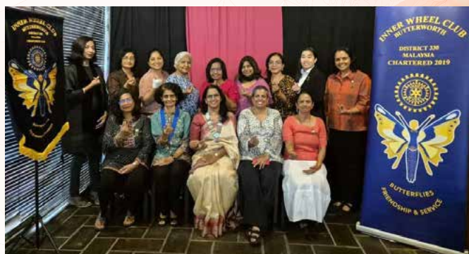
12 Jan 2025. IWC Butterworth