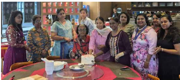
Mother's Day 2025 Celebration among IWC Parklands members