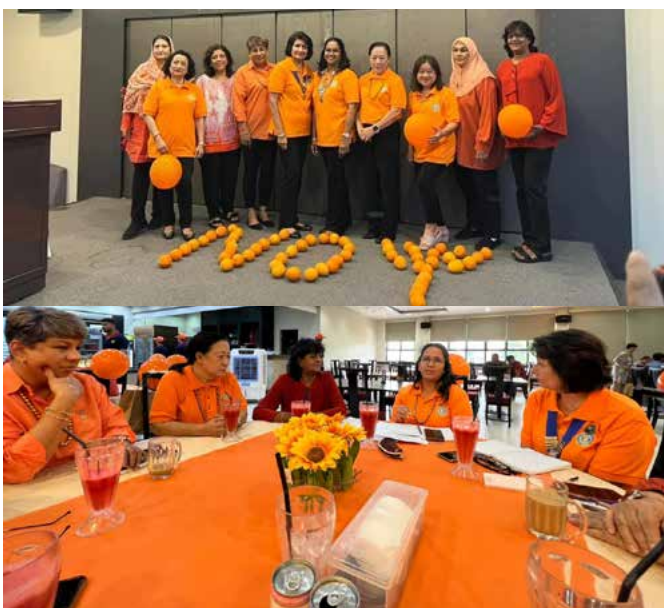
DC Vimala Thayaman Pillai's visit