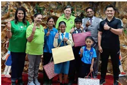
Distributing stationery and goody bags to needy students