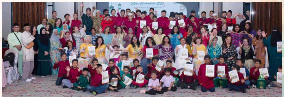
Photo memento with the orphans from the An Nur Maisarah Foundation, an Iftar Ramadan treat