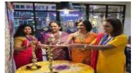
Diwali night get-together with Inner Wheel Clubs of Ipoh and Ipoh East

The Inner Wheel Club of Ioras Ipoh successfully hosted a Pickleball Fundraiser on 27 June 2025. It was a vibrant and meaningful event, bringing together fellowship and charity under one cause — to uplift underprivileged women and children in our community.