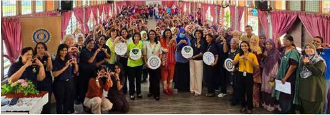
IIW President with IWC Ipoh's CCC Project; Health talk on personal hygiene and briefing on CCC to secondary school students in SMK Seri Puteri, Ipoh