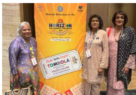
At the Triennial Conference in New Delhi – 7 – 9/2/2025