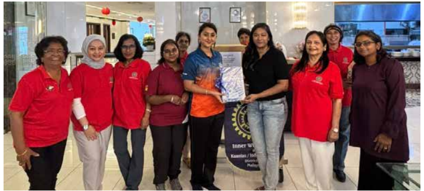
15/1/25 School Supply Aid to SJKT Ladang Kuala Reman