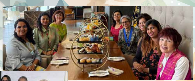
Members of Inner Wheel Club of Johor Bahru meet up in Melaka