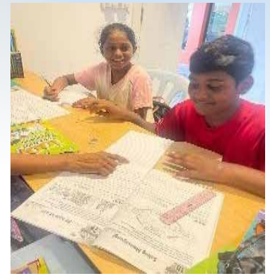
Donation of books for B40 children at a tuition centre, Kalvi Mayam.