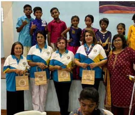
Diwali lunch for Little Penguins