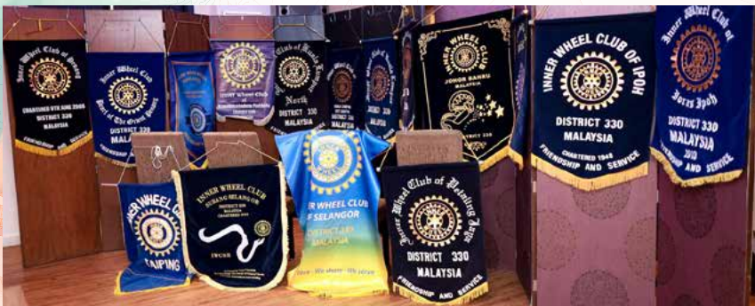
Some of the Club banners on display