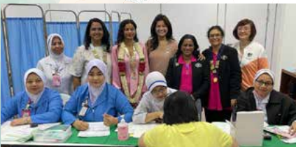
IIW President with IWC Klang's CCC Project; Pap smear awareness and free tests