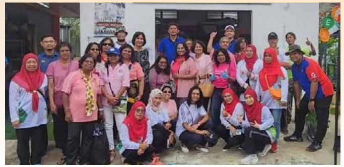
Visit to a recycle centre & urban garden (to save earth)