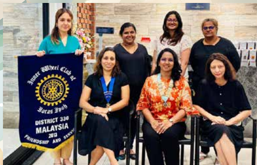
7 May 2025. IWC Ipoh