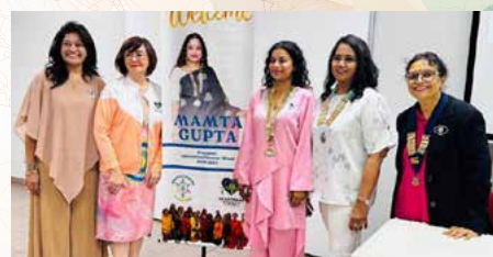
Health screening programme by the Inner Wheel Club of Klang.