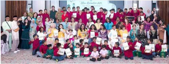
Ramdhan Iftar 2025 – Anak-anak Yayasan Amanah Nu Maisarah, Chemor