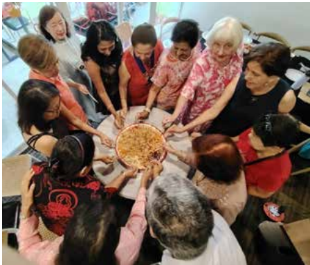
15th February 2025: CNY celebration. The tossing of Yee Sang by the members.