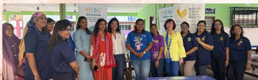
Health and hygiene talk and exhibition by Inner Wheel Club of Ipoh at Seri Putri Secondary School.