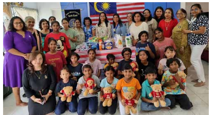
DC visit / Rainbow childrens home