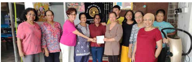
22nd April : Raised and donated RM2100 to AGAPE 'A Special Needs Home'