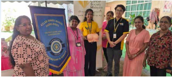
Breast Cancer Awareness 2024 at Hospital Tengku Ampuan Rahimah, HTAR Klang