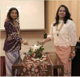
Lighting the Candle of Friendship