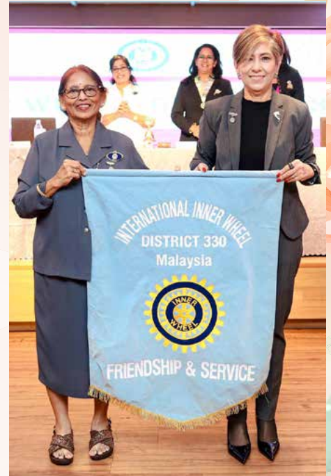
District banner parade