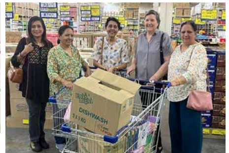
Hari Raya Cheers for B40 families – buying essential items for B40 families