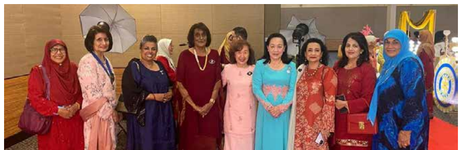
Members' Visit Alor Setar in July 2024