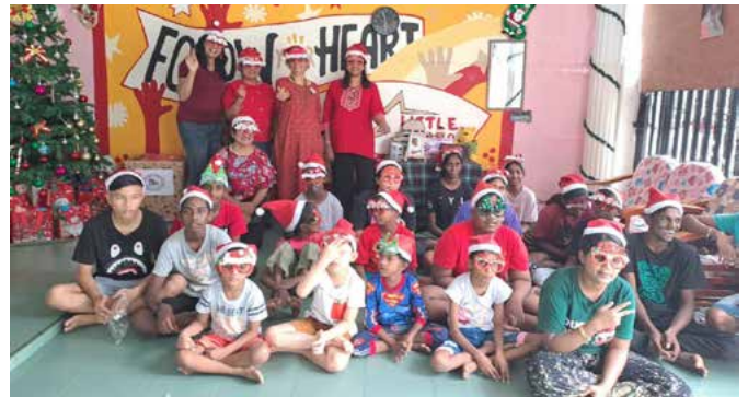
21/12/2024 – Visit to Yellow Star Home in Klang Utama