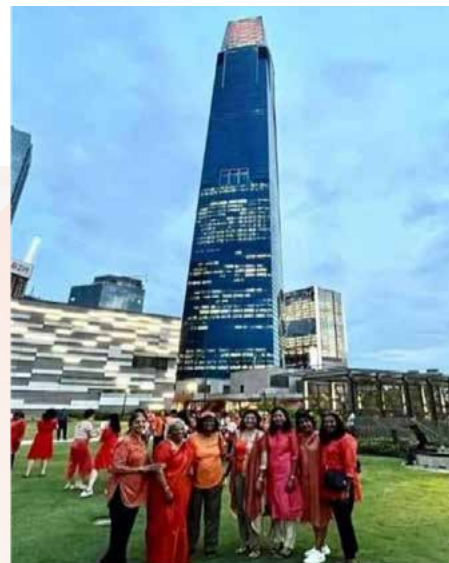
Inner Wheel Club of Subang Selangor initiated the orange light-up of TRX