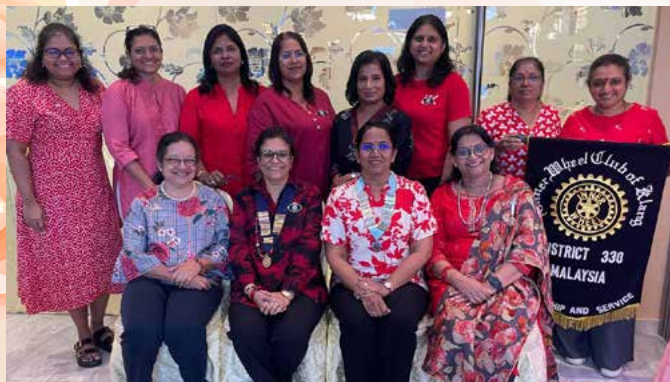
22 Feb 2025. IWC Klang