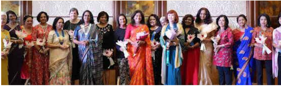
President Usha's Installation in 2024