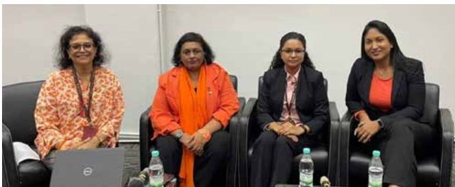
26/11/2024 A seminar was arranged in conjunction with Orange The World – Stop Violence Against Women