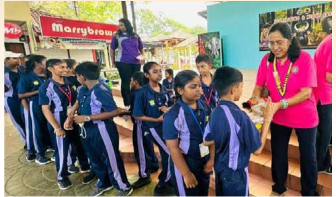
Wild Adventures with SJK (T) Jebong Lama students- 11.9.24