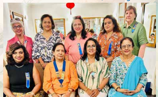
19 Apr 2025. IWC Petaling Jaya