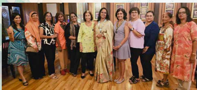
6 May 2025. IWC Ipoh