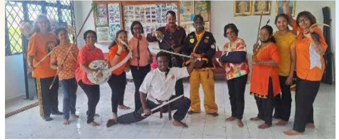
8.10.2024– Self-defence demonstration during the Orange the World campaign.