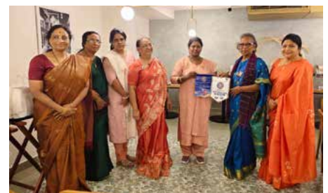
010425 - IWCKL North and Friends Explore Kerala