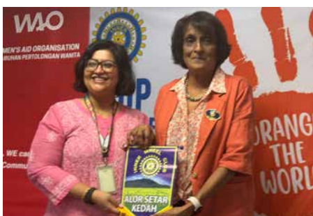
Donation to WAO in Support of OTW – 3/12/2024