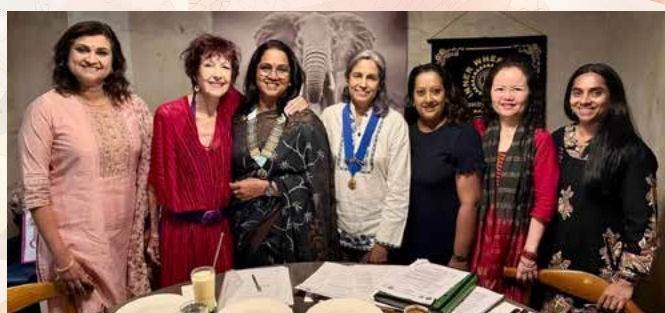
4 Jan 2025. IWC Johor Bahru