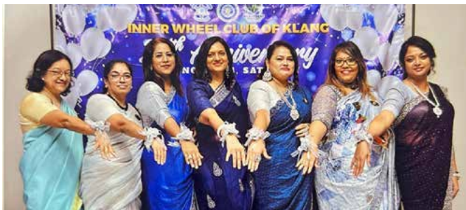
20/11/2024 -25th year anniversary of IWC Klang