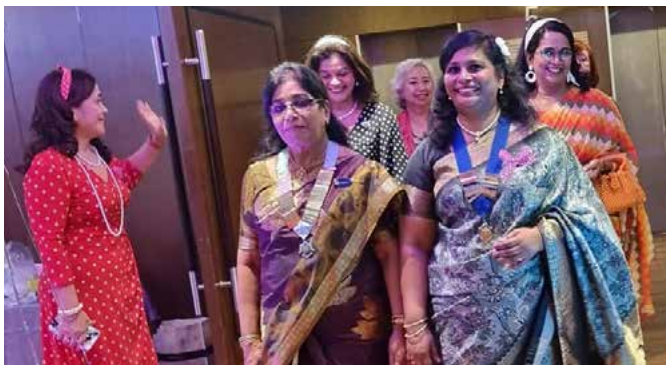
Retro Night and Fellowship