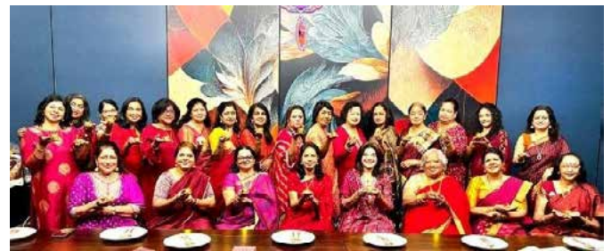
Deepavali get together