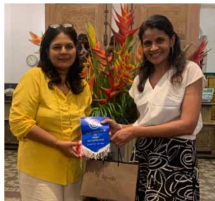
Exchange of flag at Kandy Srilanka